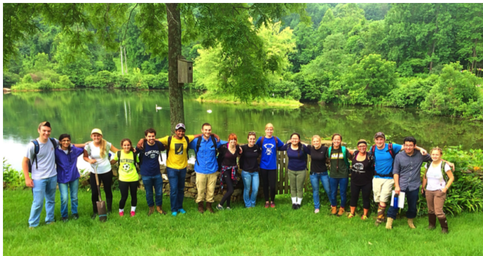
Figure 3. Environmental Studies on the Piedmont, Warrenton, VA. July 8th, 2015: Phage Ecology Research team on their soil-collection trip.

Warrenton, VA). The students came to the field station to learn about soil sample collection and to gather their samples for bacteriophage isolation. As a team, they gathered three samples from each of the six sites, for a total of 18 samples (see Figure 3).