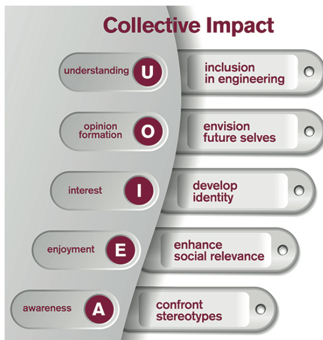
Figure 1. Outcomes essential to foster Engineering Identity

This Work in Progress paper reports on an effort that aims to address the broadening participation challenge in engineering. Through a National Science Foundation sponsored project, a pilot collective impact alliance [1], [2] was formed to enhance entry and persistence in engineering of first-generation students, women, under-represented ethnic minorities, and those with socio-economic need. The distinctive mark of this alliance is that it comprises a range of organized to self-adapting systems [3] that learn from and respond to each other around the goal of broadening participation in engineering.