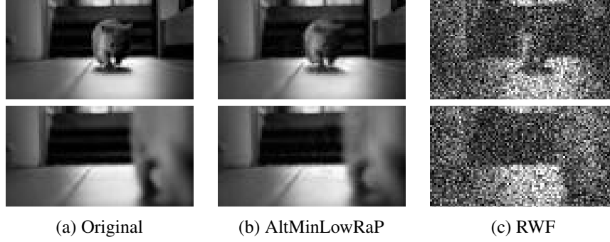
Figure 1. Comparison of recovery performance for the mouse video. The images are shown at t = 60, 78 . For more video results, see (Nayer et al., 2019).

enough so that concentration holds with mq samples.