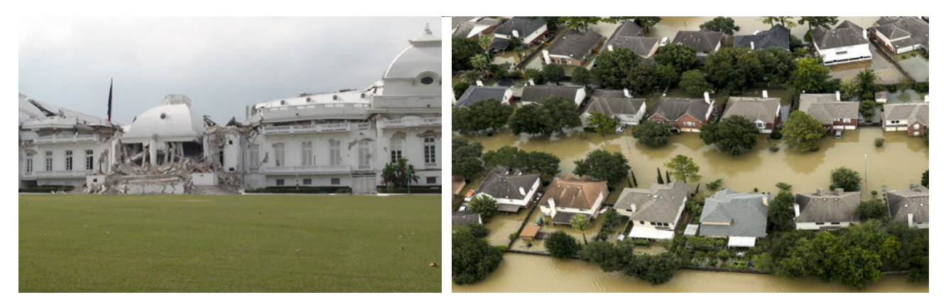
FIGURE 1 (left) The Haitian National Palace after the 2010 earthquake, which killed over 230,000 people and is considered one of the deadliest natural disasters in the Western Hemisphere. (right) Homes near Addicks Reservoir, west of Houston, after Hurricane Harvey, the costliest natural disaster in the United States in 2017.

Finally, cities are social systems. Their citizens live, work, commute, and seek leisure using the physical infrastructure systems, and they depend on the natural systems for food, fresh water, and clean air. Cities cannot thrive without the people in them, and people cannot thrive without well-functioning, resilient physical systems and healthy, abundant environmental systems.