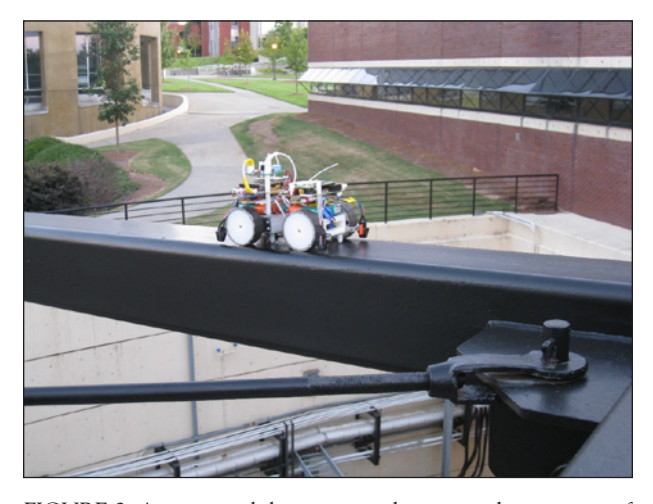
FIGURE 2 A smart mobile sensor used to assess the integrity of a bridge.

For the urban social system, redundancy can be enabled through smartphone sharing applications, such as Lyft or Uber for ride sharing, Waze or Google Maps for traffic routing, and Airbnb for accommodations. Traffic routing applications crowd-sense information from users about roadway obstructions and delays and can provide realistic estimates of travel times. In times of significant traffic perturbations, such as evacuations, these