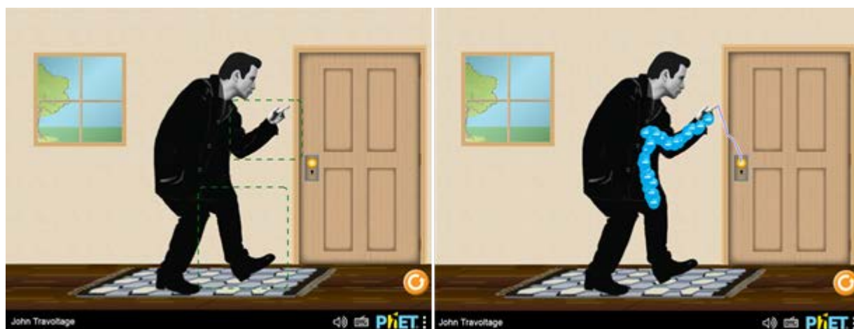
Fig. 1. PhET Sim John Travoltage.

The PhET physics sim John Travoltage (“John Travoltage”) (Fig. 1) consists of a man, John, standing on a rug with his hand reaching out towards a door. Rubbing his foot on the rug results in the transfer of negative charges from the rug onto John’s body. John’s arm can be moved in a 360-degree circle, resulting in his hand being closer or farther from the doorknob. Depending on the amount of negative charges on John’s body and the distance of his hand from the doorknob, the electrons can discharge – transferring to the doorknob and ‘shocking’ John. Science learners from upper elementary school through college can explore the relationship between the amount of charge on John’s body and the distance of his hand from the doorknob that results in a discharge/shock.