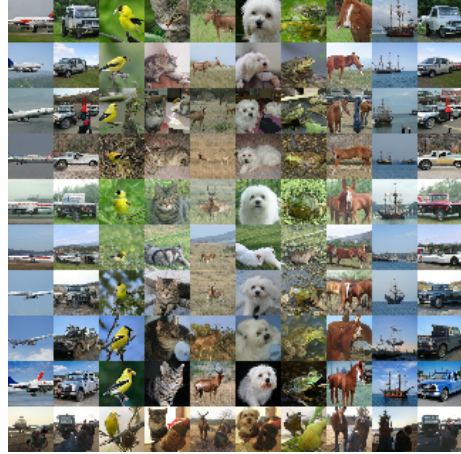
(b) BigGAN Generated ImageNet