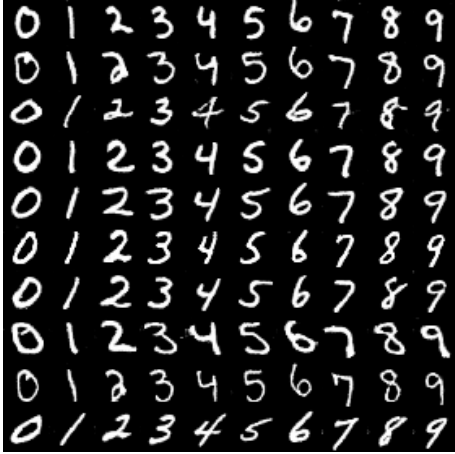
(a) ACGAN Generated MNIST