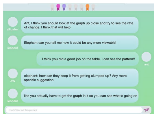
Figure 1. ModelBook Gallery Discussion.

To complement the curriculum and the small-group and whole-class discussions, we introduced three digital contexts in which students could interact. The first was a digital textbook called ModelBook that we developed to contain the curricular materials (e.g., question prompts, homework assignments), allow students to log their work (e.g., students could upload photos of their whiteboards), and enable students to interact digitally with their classmates. In ModelBook, students can see two windows: text on the left, and one of several interactive tools on the right. One tool is the Gallery, where the students upload work they completed in face-to-face groups and evaluate, critique, and provide feedback to others through discussion (see Figure 1). Another tool for whole-class discussion is called the Chat. ModelBook is designed to help students bridge their face-to-face and digital interactions. Students might work with one group to create a whiteboard, upload the photo of their whiteboard to a digital gallery, and then engage in a digital discussion about their whiteboard with another group of students.