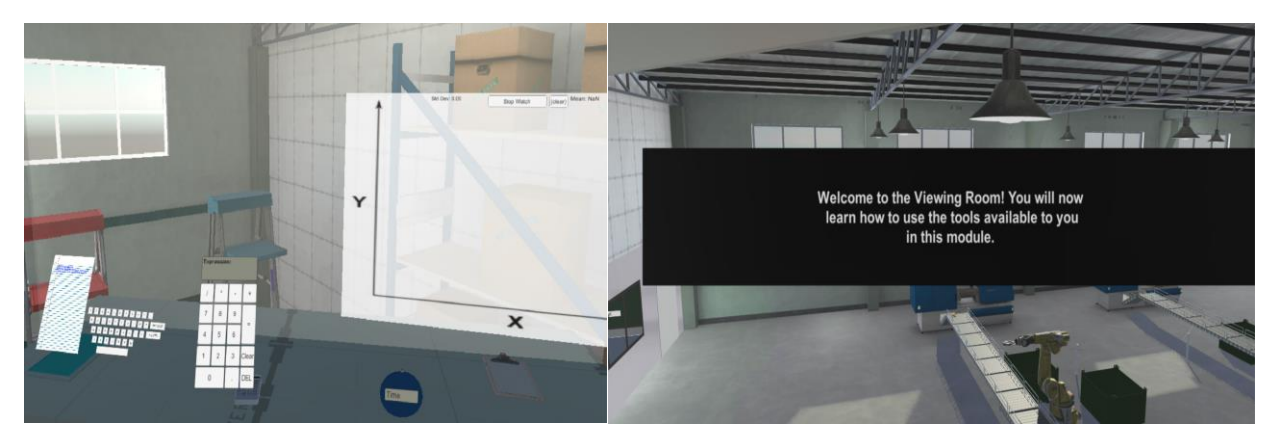
Figure 1. Snapshots from the virtual environment

The virtual environment simulates the initial stages of the manufacturing system. The system involves two injection molding machines, conveyor belts to transfer the drill housings, robotic arms that remove potential defective parts when they pass through the inspection station, and finally, the good parts are moved to a secondary assembly station. Students can collect the process times data, such as time between generated housings, and the number of defective parts. The objective is to help students learn about fundamental statistics concepts (i.e., mean, median, and mode) by allowing them to collect data from the simulated manufacturing system and perform the corresponding calculations to verify their learning. The students can interact with the objects on the manufacturing floor, such as speeding up the injection molding machine and picking up parts. Figure 1 shows snapshots from the virtual environment.