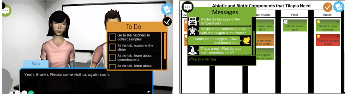
Figure 1. Screenshot of the collaborative game-based environment

To situate our design, we briefly provide an overview of the collaborative game-based environment that was designed based around PBL for middle school. As part of the PBL process, learners collaboratively engage in the process of scientific inquiry that emphasizes meaningful knowledge construction (Hmelo-Silver & Barrows, 2006). In our collaborative game-based PBL environment, students work in groups of four and solve an aquatic ecosystems problem that reflects grade six life science subject matter. Students engage in several phases of inquiry in the game, individual investigation where they collect data from the learning environment and collaborative brainstorming where students share notes and negotiate the relevance of the information to the overarching problem (See Figure 1). Students' interaction data as they engage with the learning environment are captured and can be surfaced to the teacher. This information is then available to the teacher in real-time or as reports at the end of the classroom session.