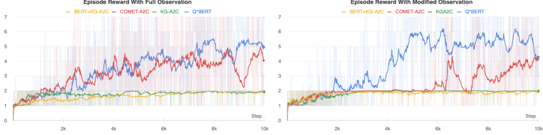
Figure 2: Reward performance for all agents on 9:05 with full observations (left) or modified observations (right). The solid lines show smoothed average performance over 4 runs, with faded bars showing max across runs. A reward of 2 indicates that the agent has entered the bathroom and a reward of 6 indicates that the agent has entered the shower.