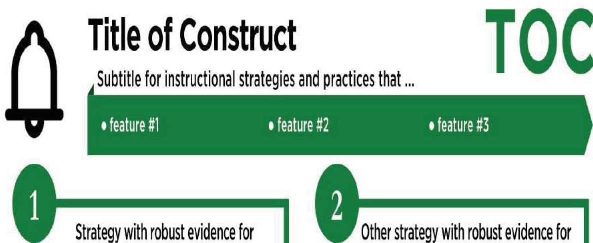
Figure 1. Design Template for the EAC-SOS Guide, with features, strategies, routines, and tools.