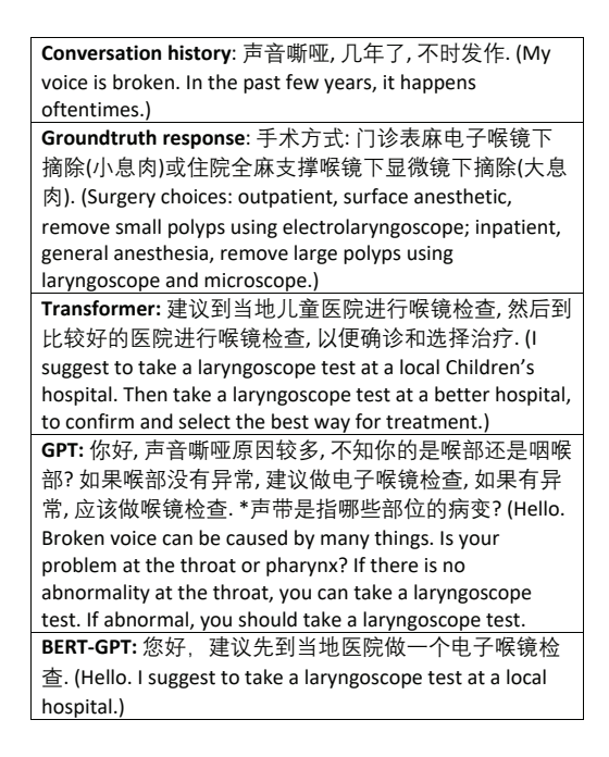
Figure 3: Another example of generated responses on the MedDialog-CN test set.

We use a Chinese dialogue dataset about COVID-19: CovidDialog-Chinese (Yang et al., 2020), for the experiments. This dataset has 1,088 patientdoctor dialogues about COVID-19, with 9,494 utterances and 406,550 tokens (Chinese characters)