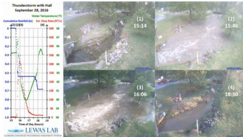
Figure 1. Case Study Example from the OWLS site