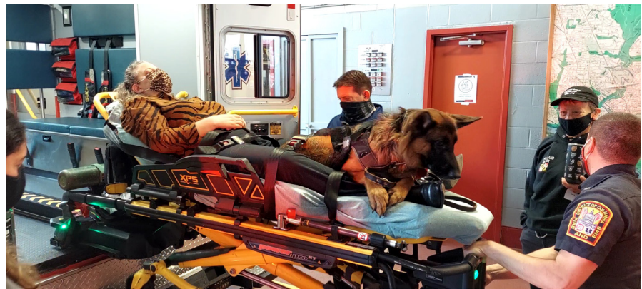
Firefighters and EMS professionals load a service dog and her handler secured to a stretcher into an ambulance.

Since the dog has been trained to detect tiny changes in their handler's nervous system, they will realize when the handler is about to have a panic attack and alert them by pulling on a sleeve, whining, or in some way getting their owner's attention. The service dog will identify a safe place, such as a couch, and guide the handler to it. If the panic