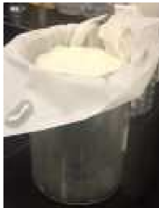
Figure 1. Acid whey collected during strain

In session two, each group shared their experiential learning experience on Community Days and then synthesized carbon nanomaterials from their acid whey. The carbonization of acid whey is straightforward as it contains lactose, a good source of carbons: 1.5 mL of concentrated sulfuric acid was mixed with 20 mL of acid whey, and the mixture was heated for forty-five minutes. The aliquot was taken about every fifteen to thirty minutes to observe its fluorescence under UV. The series of aliquots are shown in Figure 2 in daylight (top) and under a UV lamp (bottom). The as-prepared carbon nanomaterials were irradiated by a UV lamp at 365 nm wavelength, further separated by filtration and centrifuge. This part could be done in a three-hour lab period.