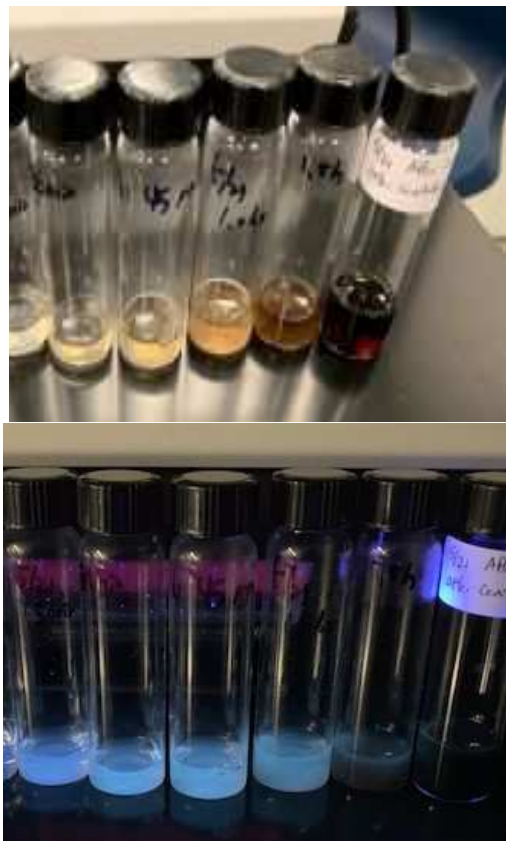
Figure 2. Sample aliquots in daylight (Top), under 365 nm UV irradiation (Bottom).

Figure 2, they investigated that fluorescence intensity was maximum after forty-five to sixty minutes of heating. After forty-five minutes of heating, the aliquot was chosen as their sample and further characterized.