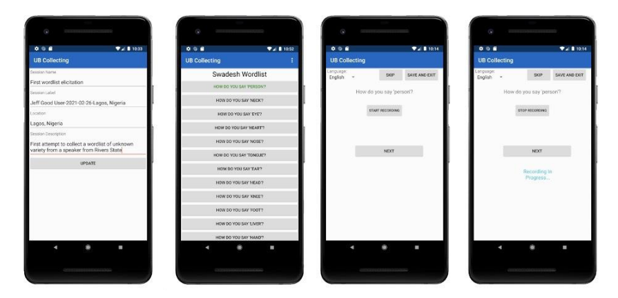
Figure 3: Illustration of workflow using the app under development

A purpose-built tool such as this has some clear advantages over general purpose tools insofar as it can produce data that is structured in ways that facilitate further annotation, analysis, and archiving. It is particularly well suited for contexts where local linguists with some training in language documentation (including students and trained community members) are in a position to do fieldwork in their home countries but may lack the technology and training needed to produce well-structured documentary corpora on their own. A disadvantage of such tools is that they cannot be readily employed by community members, and making the resources created using them available to community members would require extra steps. Future research on remote fieldwork can hopefully allow documentary linguists to better understand how to balance the potential of specifically-designed apps against the wider accessibility associated with using general purpose tools.