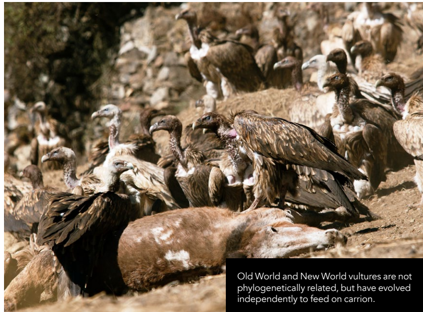
Old World and New World vultures are not phylogenetically related, but have evolved independently to feed on carrion.

The Congo Project commenced as a collaborative effort between the American Museum of Natural History, the University of Kinshasa, DRC, and the University of Marien Ngouabi, RC in 2006. The aims were to record fish diversity in the lower Congo, understand the distributions of different species, and elucidate how these species evolved and their populations formed in such a diverse environment. The first signs of the lower Congo's bizarre fish populations were discovered when the local fishing community noticed that the 'blind cichlid', Lamprologus lethops (which lacks pigment and has skin-covered eyes) was only found dead