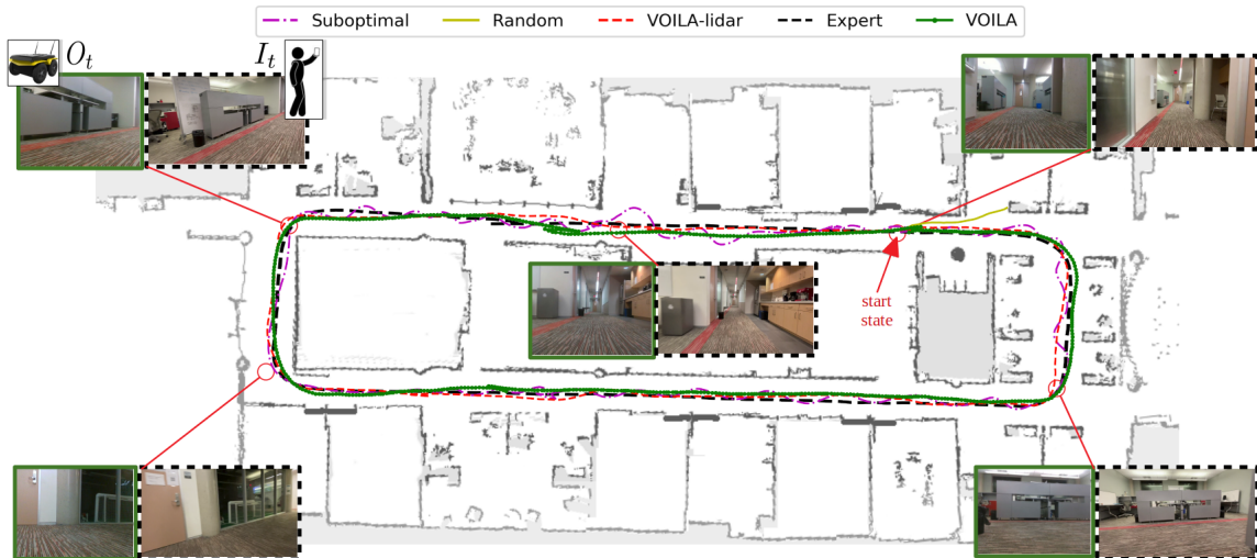
Fig. 1: Policy rollout trajectories of the VOILA agent (green) successfully imitating a demonstration behavior (black) of patrolling a rectangular hallway clockwise. The demonstration consists of a video gathered by a human walking while using a handheld camera that is considerably higher than the robot’s camera (introducing significant viewpoint mismatch). We see that the VOILA agent is able to successfully imitate the expert demonstration even in the presence of this egocentric viewpoint mismatch.

the-shelf keypoint detection algorithms that are themselves designed to be robust to egocentric viewpoint mismatch. This novel reward function is utilized to drive a reinforcement learning procedure that results in navigation policies that imitate the demonstrator.