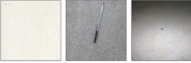
Fig. 2. Example images from various FOD-A light-level categories. Example bright image (left), an example dim image (middle), and an example dark image (right).

focus of the FOD-A, which is bounding box annotations for object detection.