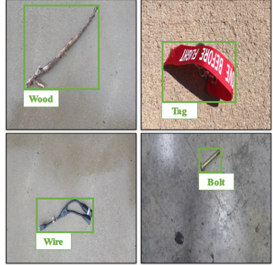
Fig. 1. FOD-A dataset images with bounding box annotation examples.

This work is partially funded by the NASA Nebraska Space Grant (Federal Award #NNX15AI09H). This work is also funded by Nebraska University (NU) Collaboration Initiative Grant.