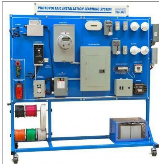
Fig 2. Solar PV Installation Learning Module [12]