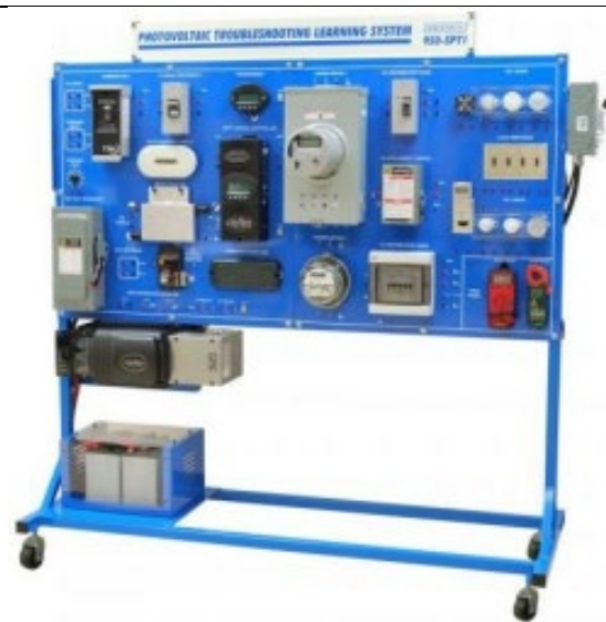
Fig 3. Solar PV Troubleshooting [12].

Our institution's new course, "Solar PV Planning and Installation," involves 2 hours in class and 2 hours of lab time, and it carries three credit hours. Circuits II (ECET 202), a prerequisite course, is available to sophomores and above. The course flow diagram is shown in Figure 4. This course's discussion of solar PV systems includes an introduction to renewable energy and PV systems, solar thermal systems, solar radiation, sun path characteristics, solar panel orientation, wire selection and sizing, ground and lightning protection, installation, startup, commissioning, and troubleshooting. In addition, it covers a variety of practical difficulties for commercial and residential applications, such as identifying and analyzing sites for array locations; developing and implementing a site layout; calculating PV circuit voltages and currents; selecting, cutting, stripping, and connecting wire; and installing components in a PV system.