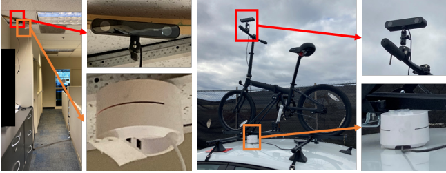
Fig. 3. Experiment Setup. In the Indoor setup, we mount a Google Nest WiFi AP and a StereoLabs ZED2 camera next to each other on the ceiling, while for outdoor setup, the camera is mounted on the handle of a roof-mounted bike. This setup simulates WiFi-enabled cameras that are becoming increasingly common.

All modalities are synchronized before they are fed into the model. Network Time Protocol (NTP) is used to synchronize the camera and phone data. The sampling rate for camera frames, IMU and FTM readings are 30 fps, 100 Hz, and 3-5 Hz, respectively. Camera data is downsampled to 10 fps and used as an anchor to resample other modalities.