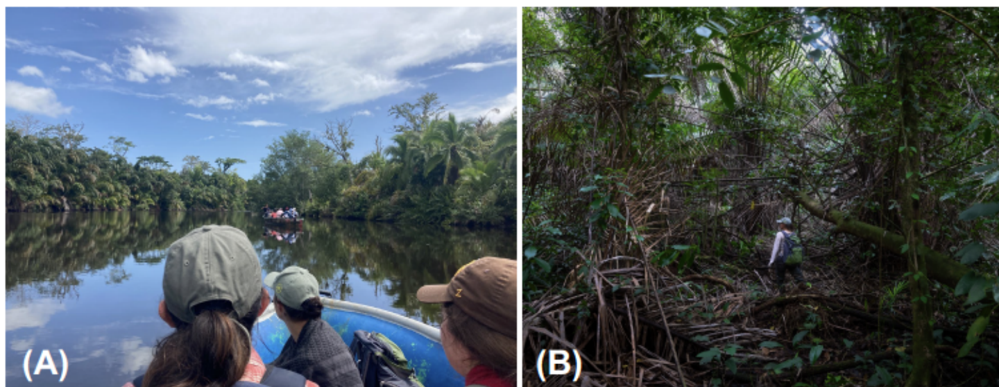
Figure 5. Yolillal (peat swamps) along the southern Caribbean coast of Costa Rica ( 9^{\circ}35'N 82^{\circ}36'W - 10^{\circ}02'N 83^{\circ}08'W ). Notably, we visited the Gandoca-Manzanillo National Wildlife Refuge, which is also a wetland of international importance given its habitat for nesting turtles and its high biodiversity, with some endangered and threatened species present (RAMSAR site #783). Many of the coastal sites we visited were only accessible by boat (A); the Raphia palms (B) combined with the muddy wet soils made these ecosystems difficult to access and challenging to navigate.