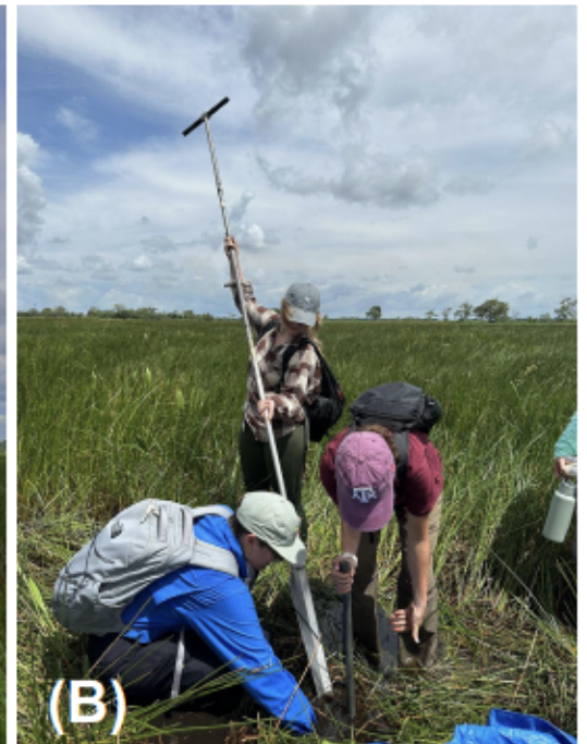
Figure 3. Medio Queso Wetland ( 11^{\circ}02'N 84^{\circ}41'W ), a transboundary wetland complex between Costa Rica and Nicaragua, is a riverine peatland (A) characterized by major water level fluctuations throughout the year ( >2 m); it is often burned for grazing. We retrieved peat cores (B) along a transect that traverses the western portion of this wetland complex.