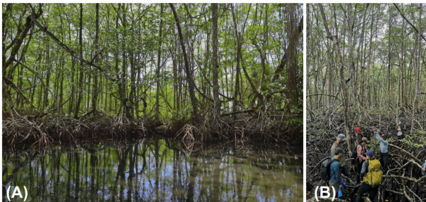
Figure 6. Red mangrove stands along the southern Caribbean coast of Costa Rica ( 9^{\circ}35'N 82^{\circ}36'W ): (A) - This mangrove forest is located along the Gandoca lagoon and is protected by local land owners, and (B) - Peat cores were collected in the mangrove forest and wells were installed to monitor water level fluctuations.