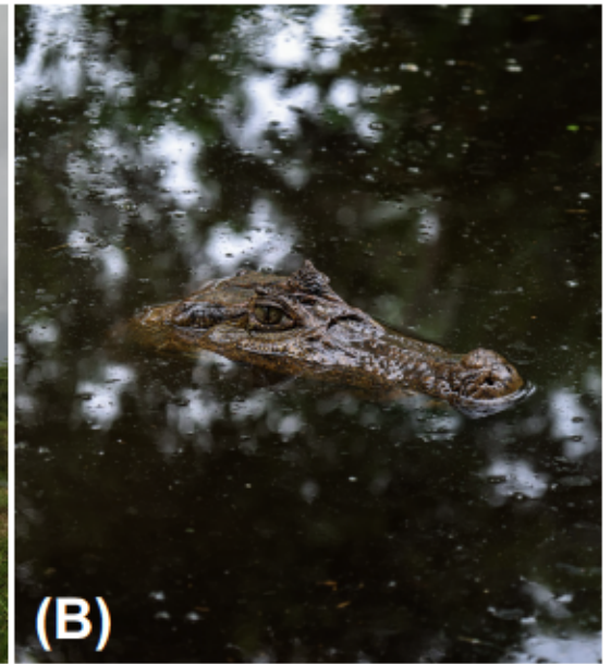
Figure 2. Caño Negro ( 10^{\circ}52'N 84^{\circ}45'W ), a National Wildlife Refuge and Wetland of International Importance (RAMSAR site #541), is home to seven types of wetlands, including (A) this palustrine wetland that serves as habitat for a great number of birds (including endangered ones), and (B) important populations of Caiman ( Caiman crocodilus ).