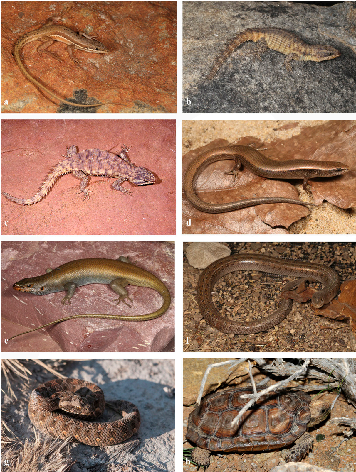
Figure 3: Representative highland reptiles from Angola and Namibia. a) Ichnotropis bivittata (Lacertidae), Tundavala (Marginal Mountain Chain), Huila Province, Angola. Photo: LMP Ceriaco©; b) Cordylus phonolithos (Cordylidae), Serra da Neve, Namibe Province, Angola. Photo: LMP Ceriaco©; c) Namazonurus namaquensis (Cordylidae), Farm Narudas (Great Karasberge), Karas Region, Namibia. Photo: RA Sadlier©; d) Panaspis wahlbergii (Scincidae), Bicular National Park (Southern Escarpment), Huila Province, Angola. Photo: LMP Ceriaco©; e) Trachylepis ansorgii (Scincidae), Caconda (Marginal Mountain Chain), Huila Province, Angola. Photo: LMP Ceriaco©; f) Eumecia anchietae anchietae (Scincidae), Tundavala (Angolan Planalto), Huila Province, Angola. Photo: LMP Ceriaco©; g) Bitis heraldica (Viperidae), Serra do Môco, Huambo Province, Angola. Photo: D Brayne©; h) Chersobius solus (Testudinidae), vicinity Auas (Huns–Orange complex), Karas Region, Namibia. Photo: J DeBoer©.