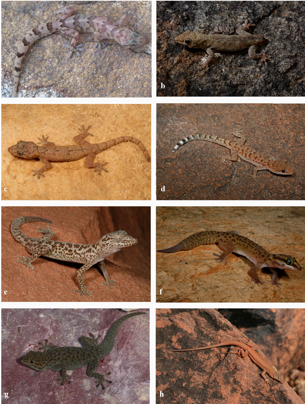
Figure 2: Representative highland reptiles from Angola and Namibia: a) Afroedura africana (Gekkonidae), Erongo Mountains, Erongo Region, Namibia. b) Lygodactylus baptistai (Gekkonidae), Serra da Neve, Namibe Province, Angola. c) Hemidactylus benguellensis (Gekkonidae), Serra da Neve, Namibe Province, Angola. d) Narudasia festiva (Gekkonidae), Farm Narudas (Great Karasberge), Karas Region, Namibia. e) Pachydactylus gaisensis (Gekkonidae), vicinity Gaias (Huab outliers), Kunene Region, Namibia. f) Pachydactylus reconditus (Gekkonidae), Rehoboth (Central Highlands), Hardap Region, Namibia. g) Rhoptropus montanus (Gekkonidae), Tundavala (Marginal Mountain Chain), Huila Province, Angola. h) Pedioplanis rubens (Lacertidae), Waterberg Plateau National Park, Otjozondjupa Region, Namibia.