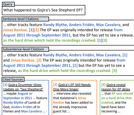
Figure 1: Example of subsentence-level citations. Compared to sentence-level citations, the finer granularity of subsentence-level citations more precisely connect the generated content with the supporting source documents.

to support their statements (Bohnet et al., 2023; Gao et al., 2023). Verifiable generation enables users to trace the information back to its source and verify its correctness, enhancing the transparency and reliability of models. Nonetheless, existing work typically provides sentence-level citations. They are unable to indicate which part of the sentence is supported by each referenced source document, leaving the effort to users to infer the connection between the content and its citation (Liu et al., 2023a; Schuster et al., 2023). This ambiguity hinders the user's ability to verify the information efficiently and understand the scope of the supporting documents.