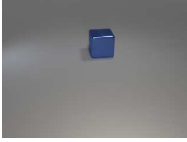
(a) Single-object dataset. Example true label and distractors are: { blue cube , yellow sphere, gray cube, purple cylinder, cyan cylinder}