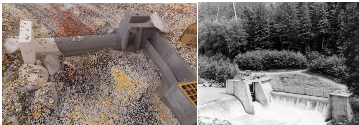
Figure 2. (Left) Student-designed model of a dam used to explore the impact on sediment from dam removal. (Right) Historical photo of the dam.

The first quarter integrates Introduction to Engineering, Pacific Northwest History, and Precalculus for Engineering 1. For their final project, students compared historical photos to current ones of a site in Whatcom County, located sources in a regional archive, and documented changes to the engineered environment over time. Over the quarter, students practiced the skills of a historian -- sourcing, corroboration, and context -- so that by finals week, they were prepared to write a four-page research paper about a site in Whatcom County and present their findings visually during finals week. Alongside this work, they learned how to use laser cutters and 3D printers to add an engineering model to support their history research. The final synthesis required students to answer one of the essential questions developed for the learning community [3]: How does the engineered world affect how we live?