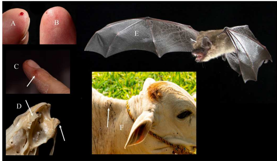
Fig. 1. A miscellany of bat bites. (A) The defensive bite from a big brown bat, Eptesicus fuscus , drew blood from one puncture on a human finger. (B) Note how the same bite site is easy to overlook after removing the blood. (C) The defensive bite of a very irritated common vampire bat, Desmodus rotundus , produced a noticeable cut that bled profusely (white arrow). (D) Ventral view of the skull of D. rotundus showing its razor sharp, triangular upper canine teeth (white arrows). (E) A flying E. fuscus showing both upper and lower canines. Photos of bats in flight often show them with open mouths because they are echolocating. (F) Calf with a D. rotundus feeding bite (white arrow). Note the trail of dried blood. Vampire bats make feeding bites with their upper incisors and the wound is usually an obvious scrape about 5 mm long and 5 mm deep.

ten the focus of myths, negative associations, and misconceptions (Fenton and Simmons 2015; Fenton et al. 2020a, 2020b). Additionally, the public perception of the risks associated with bats is strongly influenced by the fact that some species are reservoirs of lyssaviruses (Fenton and Rydell 2023; Fenton et al. 2020c). Importantly, bats showing clinical signs of rabies do not recover from the infection and do not chronically excrete virus (Moreno and Baer 1980; Franka et al. 2008). Rabies is an acute infectious disease that kills bats as well as other mammals (Moreno and Baer 1980; Franka et al. 2008). Even so, bats have an astonishing resistance to many viral infections, including the capacity to frequently clear lyssaviruses before a productive infection establishes (Blackwood et al. 2013). This has spurred renewed interest in studying bat immunity (Blackwood et al. 2013; Irving et al. 2021; Banerjee and Mossman 2022).