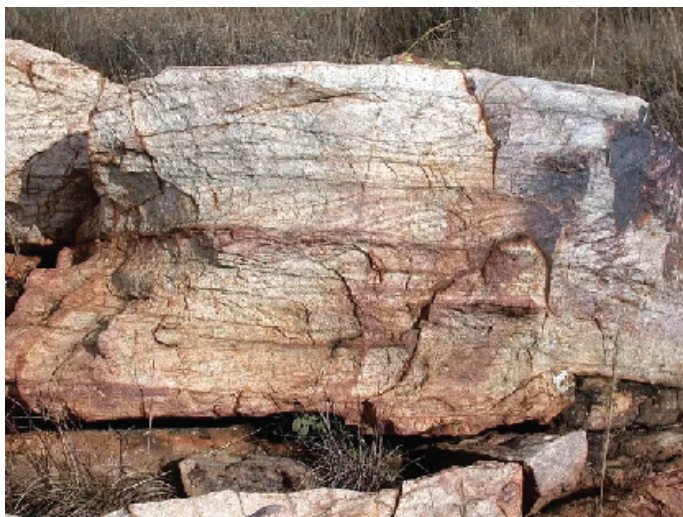
Figure 3. An upside-down stratigraphic section near Vredefort, South Africa. The cross-bedding patterns in the outcrops of the Witwatersrand quartzite, which are effectively intraformational angular unconformities, indicate that the entire section is inverted. Geologists immediately recognize the overturned stratigraphy; compare to Figure 2F.

Siccar Point revealed deep time, but it also reveals the role of the mind in assembling experiences into a working model that encompasses geological time. The importance of Siccar Point emerged from Hutton's deliberate search for the contact between the gray rocks he observed at St. Abb's Head to the east and the red ones he encountered in Pease Bay to the