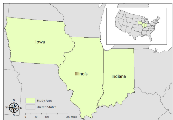
Fig. 1. Study area in the U.S. Cornbelt.

To examine farmers' risk perceptions of cover crops, we distributed mailed and online surveys across the three states (Illinois, Indiana, and Iowa) with pilot programs offering a crop insurance premium discount for acres planted in cover crops (Fig. 1). We used both random and convenience sampling strategies to maximize response. For the random sampling, we worked with a private company, DataForce, to distribute an informational postcard with a link to take the survey online, followed by two rounds of mailed paper surveys to 8,000 farmers split evenly across the three states in our study area from February to April 2023. Farmers returned 669 surveys (484 mailed copies and 185 completed online). The low response rate of 8.4% of the random sample may reflect both the ongoing declining trends of farmers being over-surveyed (Johansson et al., 2017; Glas et al., 2019), as well as the specific