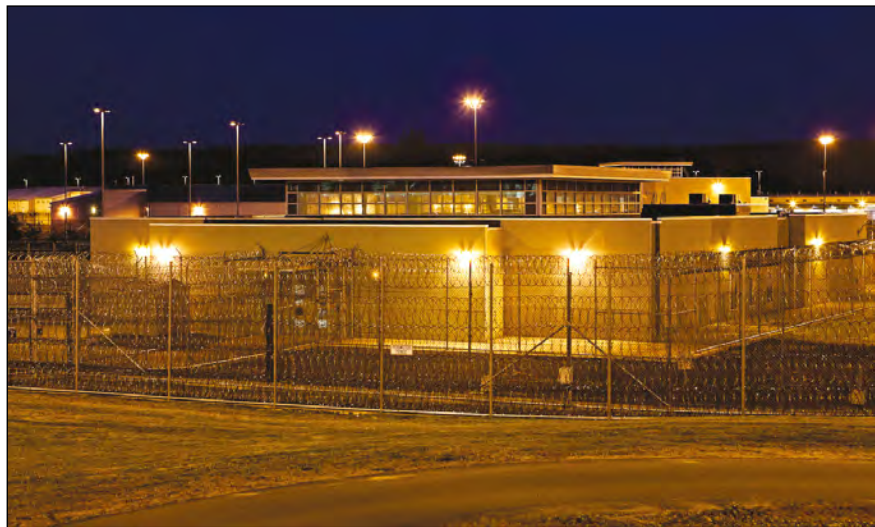
Figure 1. The Stafford Creek Correctional Center, in Washington State, represents a venue of an extremely nature-deprived population.

To control for differences in the risk of inmates engaging in violent behavior while in the IMU, we developed a risk model using Stochastic Gradient Boosting (SGB), which is a machine-learning algorithm. The participants for the development of the risk model included all inmates who were placed and spent at least 30 days in the IMU system at SRCI from 1 Jul 2009 through 20 Aug 2015 ( n = 1486 unduplicated inmates randomly selected from 2500 unique unit episodes). The dependent target variable for the model was a person day rate of violent infractions, or disciplinary referrals (DRs). Person day rates were calculated by dividing the total number of DRs that were documented by officers in a particular cellblock unit during a pre- or post-period by the total number of days each and every inmate was in a particular cellblock unit during that period. For this variable, inmates were categorized as being in the top 20% (0 = not in the top 20% and 1 = in the top 20%).