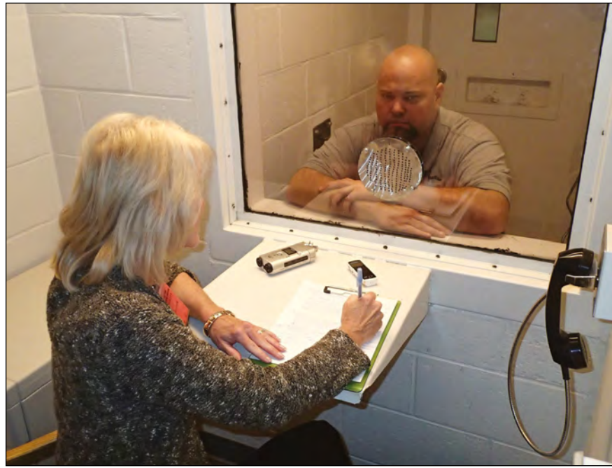
Figure 4. Venue of case study interviews carried out in solitary confinement cellblock E-B (SRCI officer takes the place of the inmate, whom researchers could not photograph).

Although these potential interactions should be noted, a review of the Hawthorne effect by Clark and Sugrue (1991) concluded that uncontrolled novelty effects (the