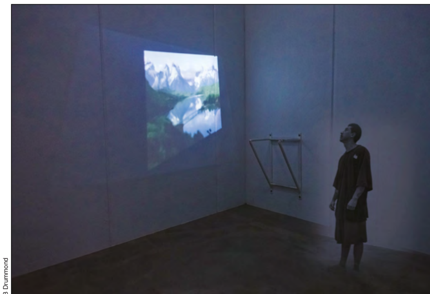
Figure 2. Inmate in solitary confinement cellblock IMU E-B viewing nature video imagery in an exercise room.

as agitated or troubled, using a nature video as a calming intervention. Staff logged inmates' video choices between 28 Sep 2013 and 28 Mar 2014 (except for 22 days when the projector was broken).