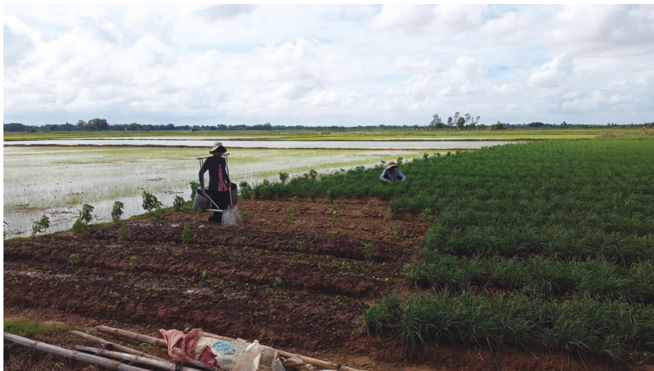
Deltas are global intensive food production areas.

exposure to environmental change has important consequences on people's livelihoods and human development of the delta regions and beyond. In the case of the Amazon delta, the state-level human development index of the Brazilian State of Pará, where most of the delta area is located, is the third lowest among the 27 Brazilian states, with the education subindex ranking second poorest. 7