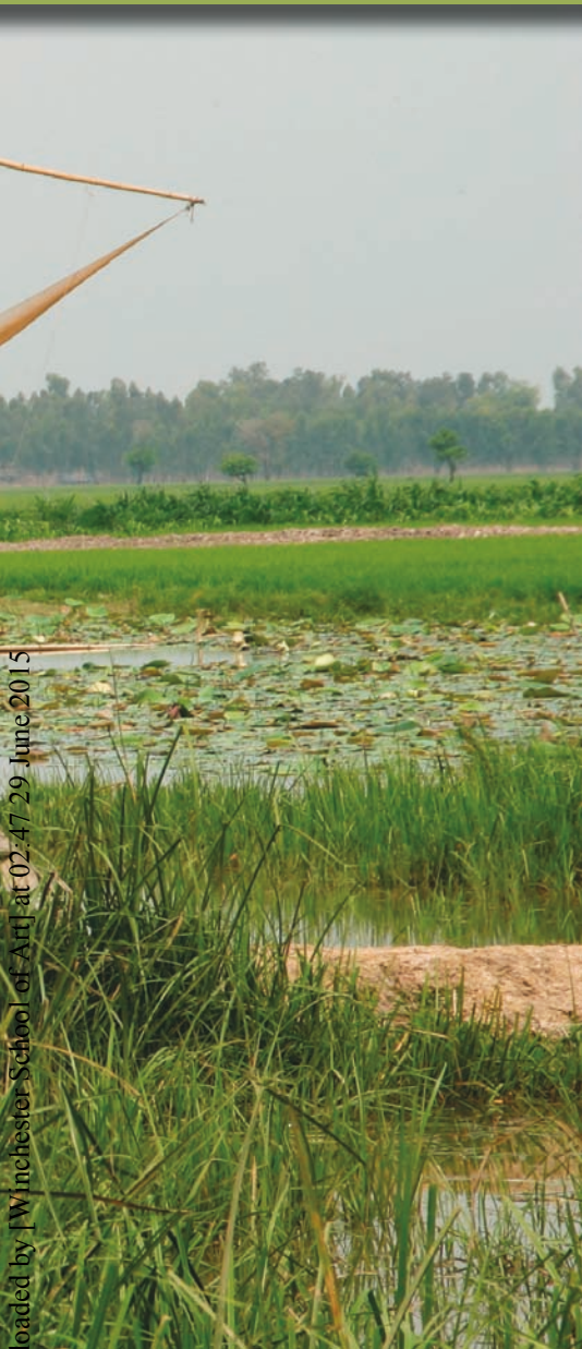
A delta on the Caribbean coast of Honduras.