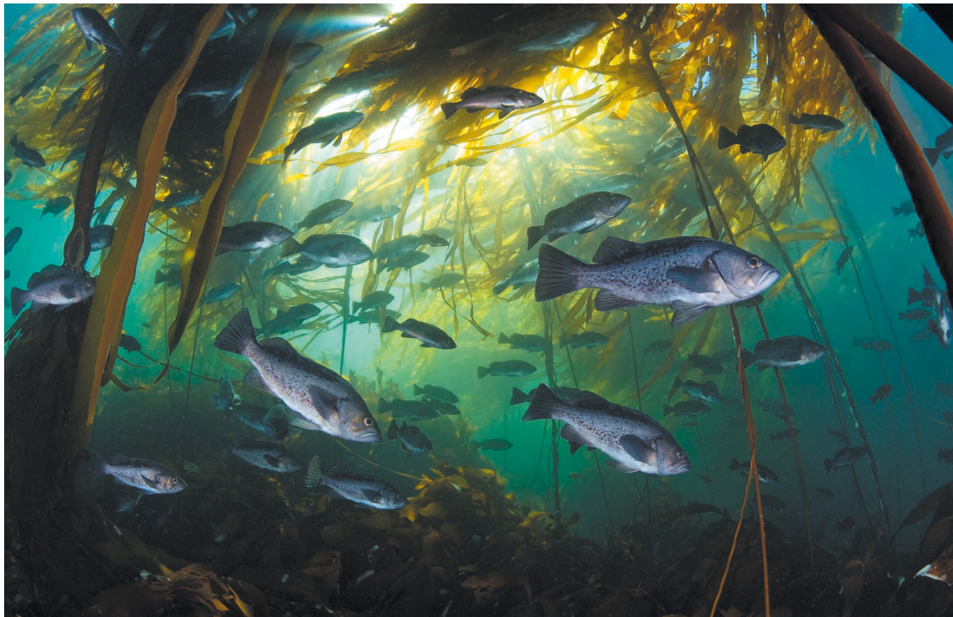
Fish and other marine life are affected by ocean weather: drastic variations in temperature, pH, oxygen and salinity that are in turn influenced by climate change.