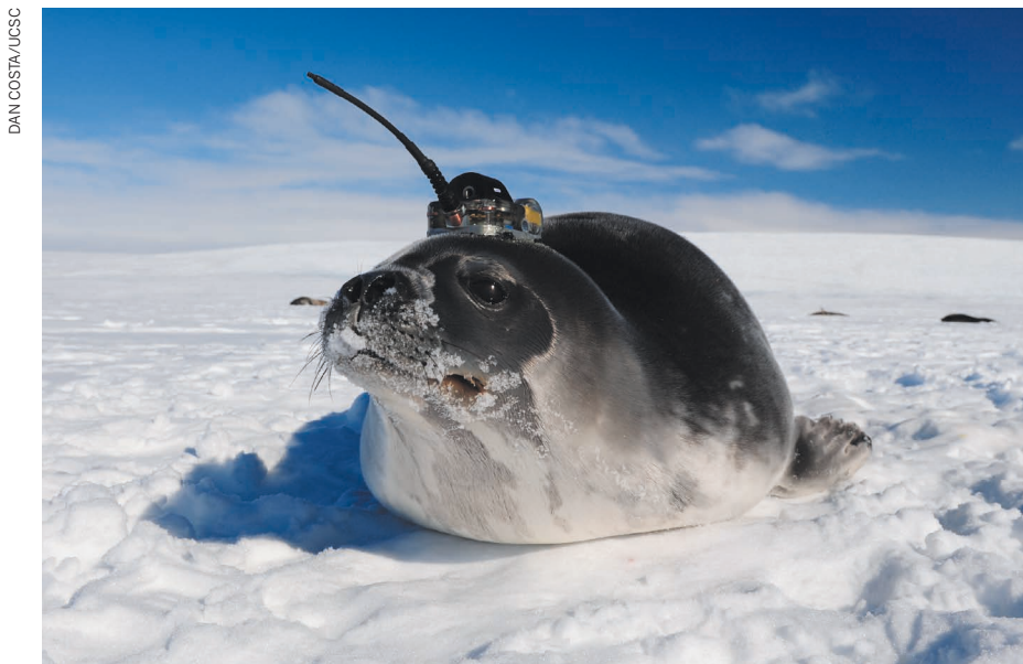
A Weddell seal equipped with a sensor for measuring ocean conductivity, temperature and depth.

warming evenly across the tropics and poles. Some areas are even cooling 13 .