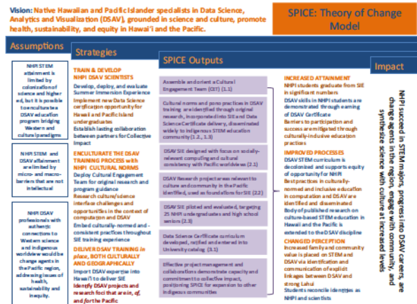
Figure 1: SPICE Theory of Change Model