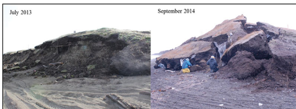
Figure 3. Examples from Walakpa in Alaska of newly exposed archaeological layers that are quickly degrading due to multiple processes (permafrost thaw, frost/thaw processes, microbial degradation and wave action during storms) (photograph by Anne M. Jensen).