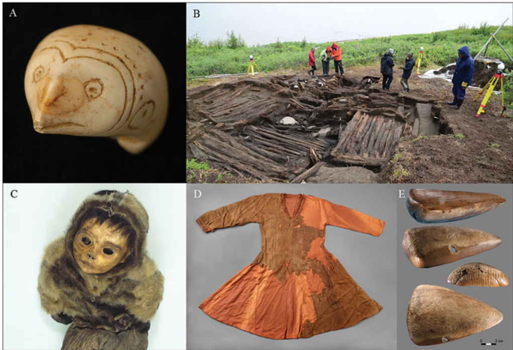
Figure 2. Examples of some of the extraordinary archaeological finds from the Arctic: A) ivory owl effigy toggle from Nuvuk, Alaska; B) pre-contact driftwood house floor from Kuukpak in the Mackenzie Delta, Canada; C) human remains from Qilakitsoq, Greenland; D) preserved medieval textiles from Andøy, Nordland, Norway; E) 31 000-year-old decorated ivory scoop from the Yana site, Arctic Siberia.