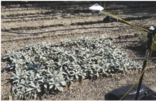
Figure 2. Measurement of canopy albedo on Stachys byzantina according to ASTM E1918-16 (2016) (Modena, September 2016)