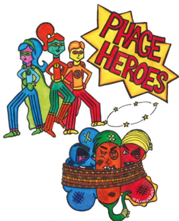
FIGURE 1. The team of phage heroes conquering their bacterial villains (artwork by Kema Malki). This design can be used to make custom temporary tattoos to serve as a reward for successfully capturing the correct bacteria in the outreach activity.