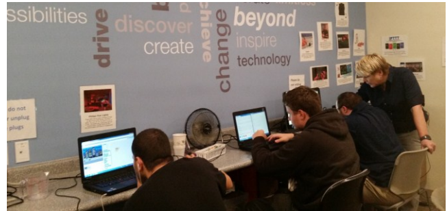
Figure 1. Members of Code Club work together on programming projects. One member works with an instructor to solve a programming problem.

© 2019 Copyright is held by the owner/author(s). Publication rights licensed to ACM. ACM ISBN 978-1-4503-5970-2/19/05...$15.00.