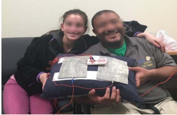
Figure 2. Code Club members demonstrate a prototype smart pillow. Sensors on the pillow detect taps and play an audio message based on the number of taps.

After members demonstrated success in working with smart home technologies, Sally felt that the group might be able to handle more complex technical challenges, including creating their own computer programs. Sally examined several programming tools that targeted novice programmers, including code.org, Python, and Scratch. Sally eventually decided to teach Scratch, as she felt that its simple structure and visual nature could be appropriate for her members, and because she was able to find high-quality instructional resources online. Sally described Scratch as a tool that is appropriate for all ages: