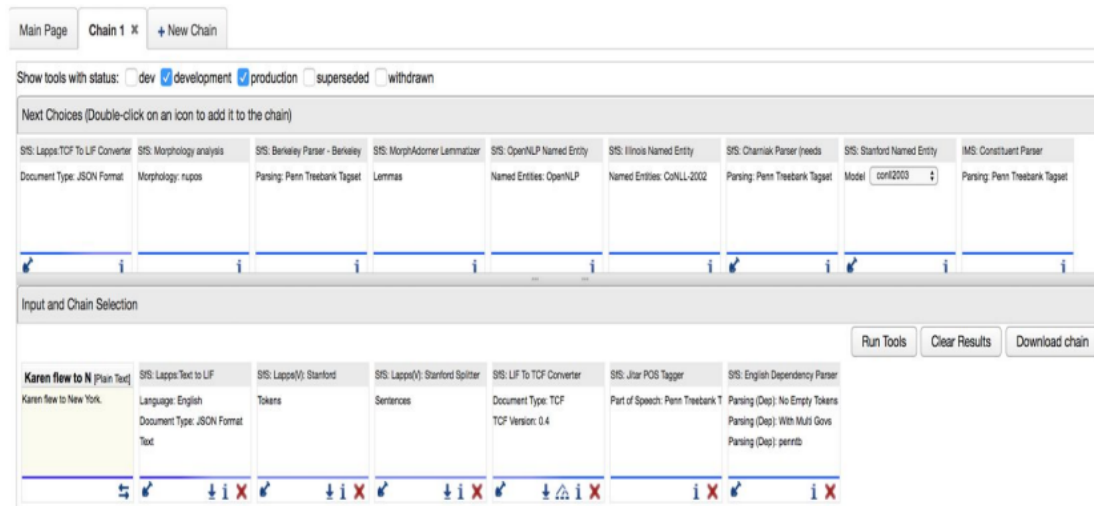
Figure 5: Invoking LAPPS Grid services from WebLicht.