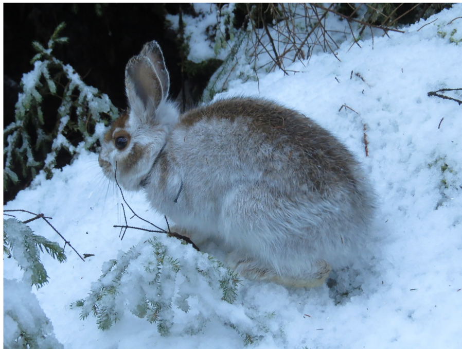
Fig. 1. A snowshoe hare in West Virginia midway through its fall brown to winter white coat color molt on 10 November 2014.

We used a combination of field methods to document winter coat color in snowshoe hares and weasels in West Virginia in 2014. We live trapped 12 molting snowshoe hares from West Virginia to confirm that they molt white in winter (Fig. 1), validating historical accounts (Brooks 1955). Because weasels are notoriously difficult to capture in the wild, we used a non-invasive sampling framework consisting of remote cameras and bait tubes to detect and monitor weasels. We recorded 31 photographs of long-tailed weasels and five of least weasels between November and February, months when both weasel species should be all or mostly white if they adopt the white winter coat. Unlike the winter white snowshoe hares, both long-tailed weasels and least weasels at our study site were winter brown (Fig. 2). Together these figures depict an interspecific polymorphic response in winter coloration among sympatric winter white hares and winter brown weasels.