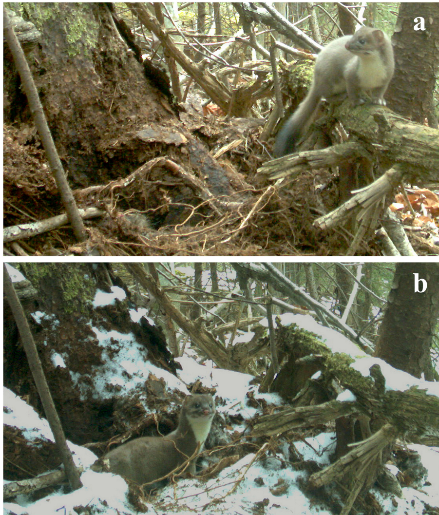
Fig. 2. A brown long-tailed weasel in West Virginia (a) on a snowless brown background on 12 November 2014 and (b) on a snowy background on 16 November 2014. Photographs were taken at the same location four days apart.

Because we could not distinguish individual weasels based on photographs, we established two criteria to reduce pseudoreplication arising from sampling the color molt of the same individual multiple times. Our approach was derived from average weasel movement parameters across space and time (home range diameter of 1.5 km; movement rate of five meters/minute; Gehring and Swihart 2004). Using these criteria, photographs represented different individuals when they were separated by (1) more than the expected distance moved over time and (2) more