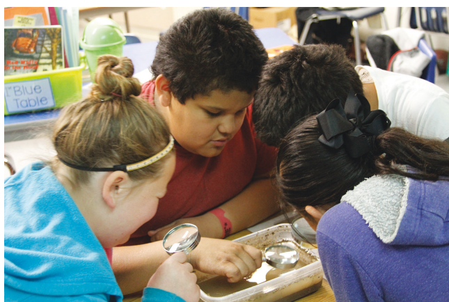
Figure 3. When the local school district recognized that students whose first language was not English were slipping behind their native-English speaking peers, they contracted the Jornada program to develop inquiry-based ecology education programs with student handouts and teacher background information in both Spanish and English. These activities are being used in fourth and fifth grade classes in southern New Mexico to increase the amount of science instruction time. One activity includes students spending several weeks tracking the population size of various arthropod species that hatch from soil collected in playas, ephemeral lakes in the desert.