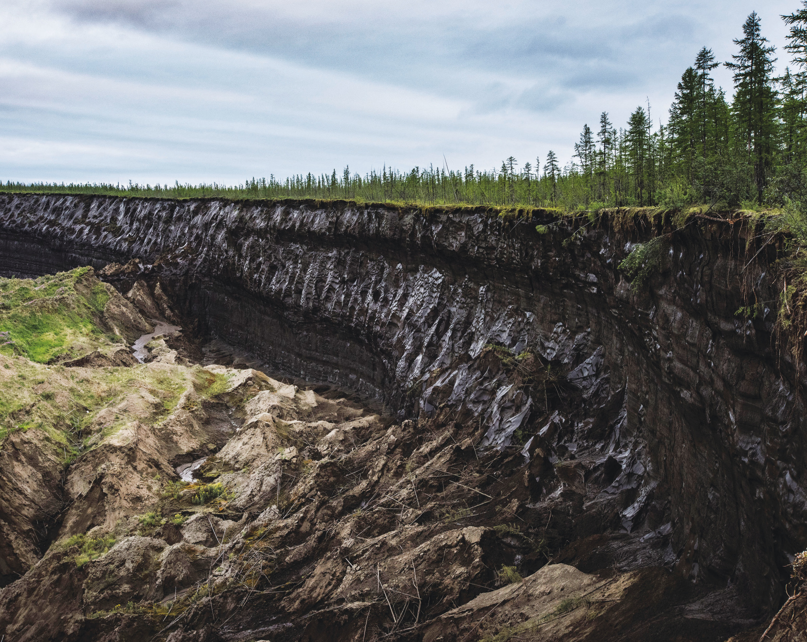
The Batagaika crater in eastern Russia was formed when land began to sink in the 1960s owing to thawing permafrost.