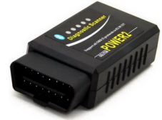
(b) An OBD-II Dongle