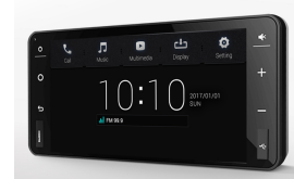
(a) An IVI System

OBD-II dongle apps. In addition to car manufactures, some 3rd-party service providers including many auto-insurance companies also develop car companion apps to interact with vehicles through the On Board Diagnostic (OBD-II) port. In general, these OBD-II dongle apps (short as dongle apps) connect to a dongle plugged into the vehicle, and these OBD-II dongles work like wireless sensors connecting to the OBD-II dongle apps via Bluetooth, Wi-Fi, or cellular network and at the same time, directly communicate with the inner CAN