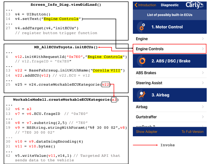
Fig. 3: A motivating running example illustrating the generation of a CAN Bus command in a dongle app.

Precise identification of the generation path. For car companion apps, there is neither standard guidance nor unified