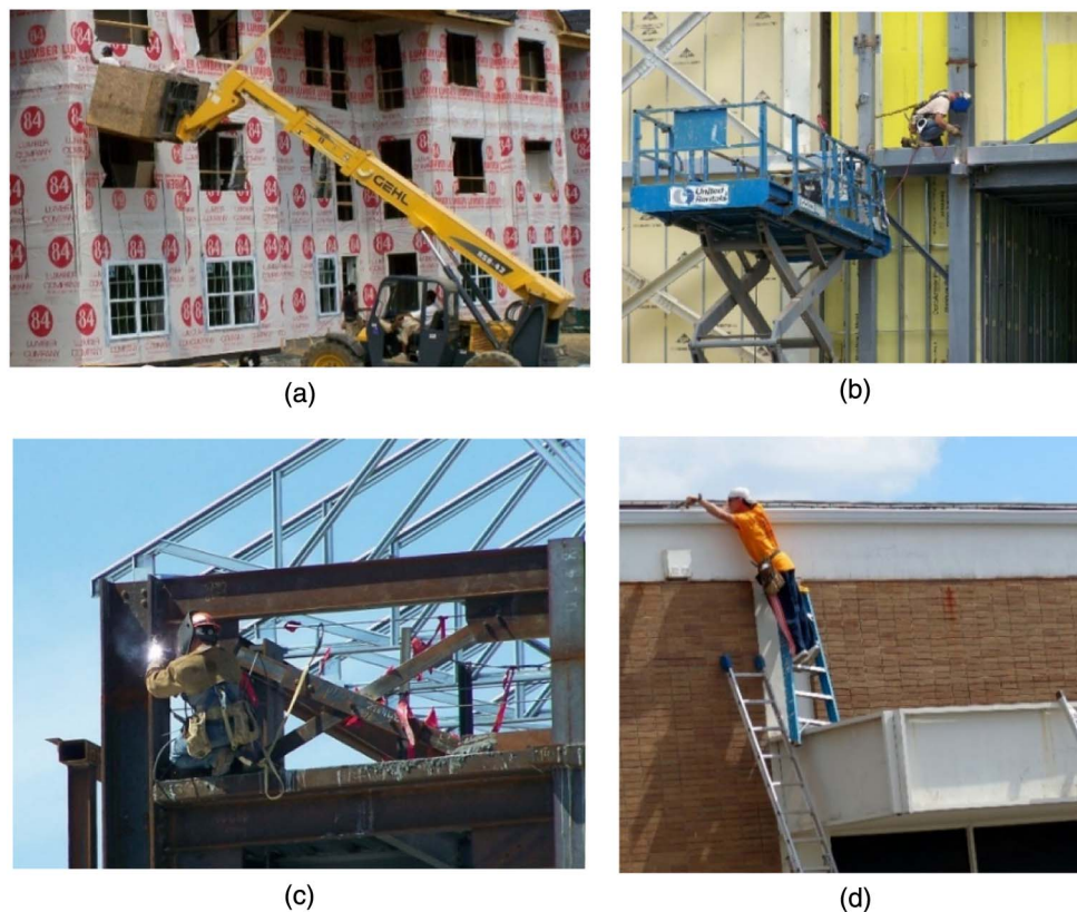
Fig. 3. Examples of scenario images.

original data and obtain p -values based on created distributions (Adams and Anthony 1996; Anderson 2005). Second, the permutation techniques can provide higher power relative to non-parametric tests because it relies on using actual data rather than ranks (Ludbrook and Dudley 1998; Drummond and Vowler 2012). The deducer package in the Java Graphical User Interface (GUI) for R 1.7-9 of the open-source statistical package R Version R2.15.0 (R Development Core Team 2012) was used to perform permutation analysis. We set significant results at 0.05 (95% statistical significance) and 0.1 (90% moderately statistical significance) alpha levels, as subsequently discussed in greater detail.