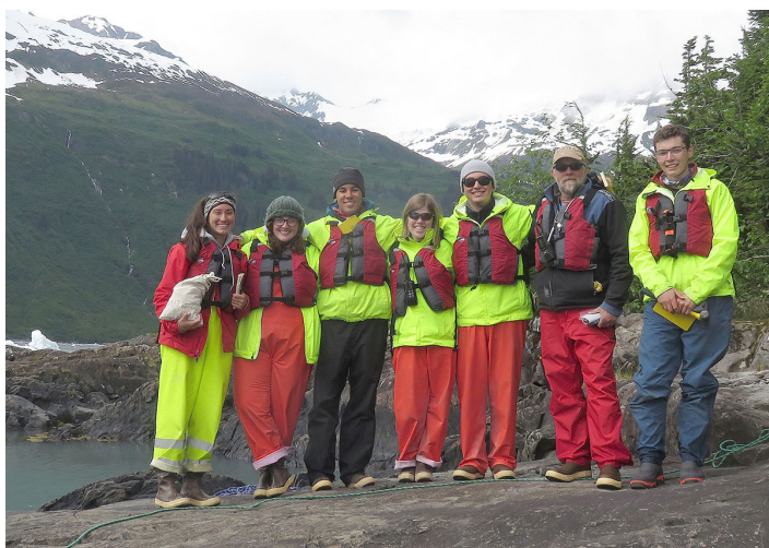
Figure 2. The 2018 Keck Alaska team collecting a detrital zircon sample in Unakwik Inlet.

be as young as 60 Ma, and the age and provenance of the Orca and Valdez group using detrital zircons in this area had not been studied until now.