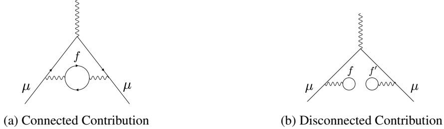
Figure 1: The Feynman diagrams for the contribution to a_\mu from the leading-order HVP. The quark loop in (a) is radiatively corrected by virtual gluons and sea quarks (not shown). In the same way, the quark loops of flavor f and f' in (b) are connected by virtual gluons and sea quarks (not shown).

with k = 1, 2, 3 and J_k = i \sum_f Q_f \bar{\psi}_f \gamma_k \psi_f with f = u, d, s, c . Here, Q_f is the charge of the quark of flavor f in units of the electron charge e . The correlator can be divided into two parts: connected and disconnected. Fig. 1 shows the schematic diagrams associated with these two pieces.