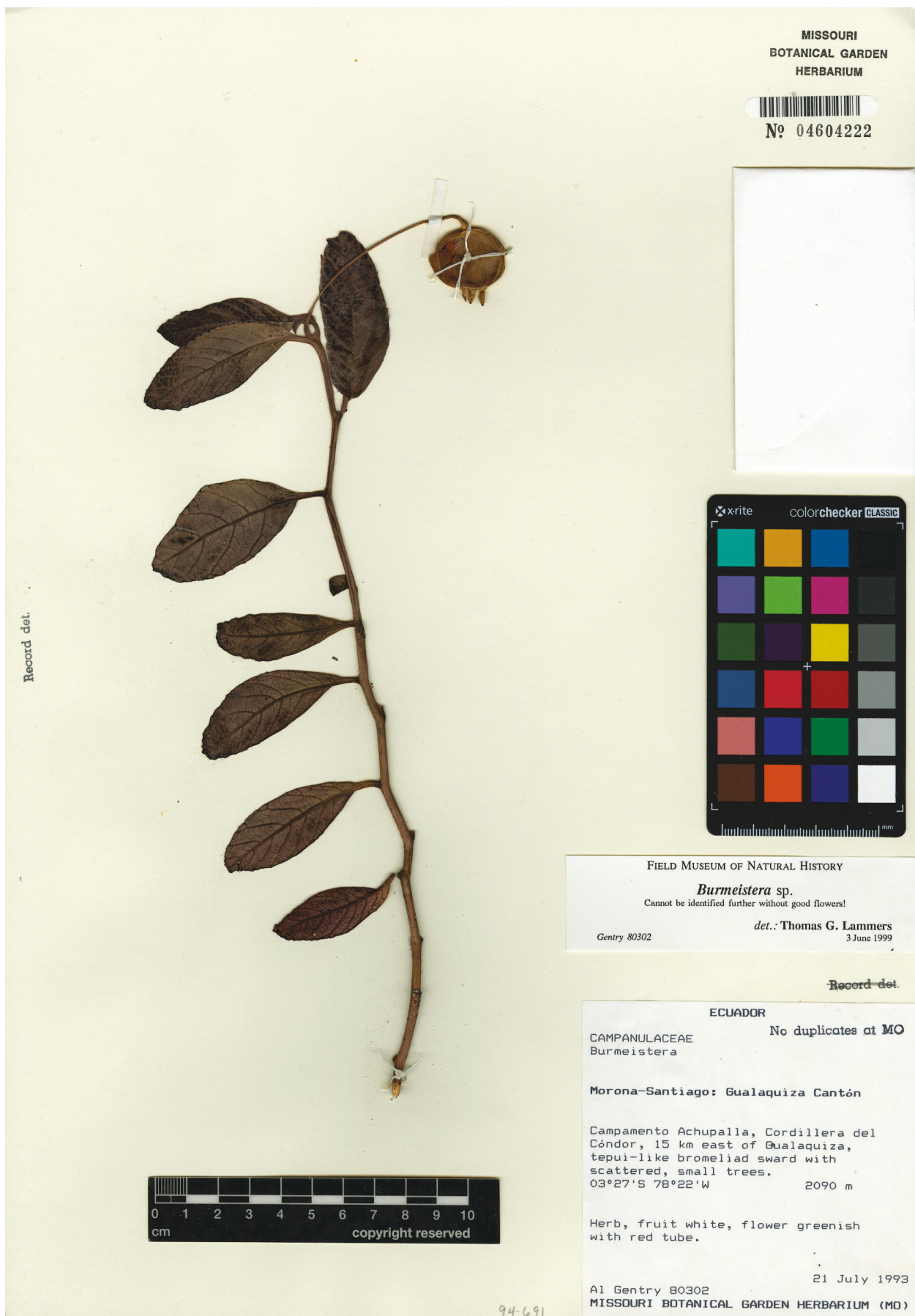
FIGURE 2. The first known collection of Burmeistera quimiensis made by Alwyn Gentry on July 21, 1993, during his last field trip.