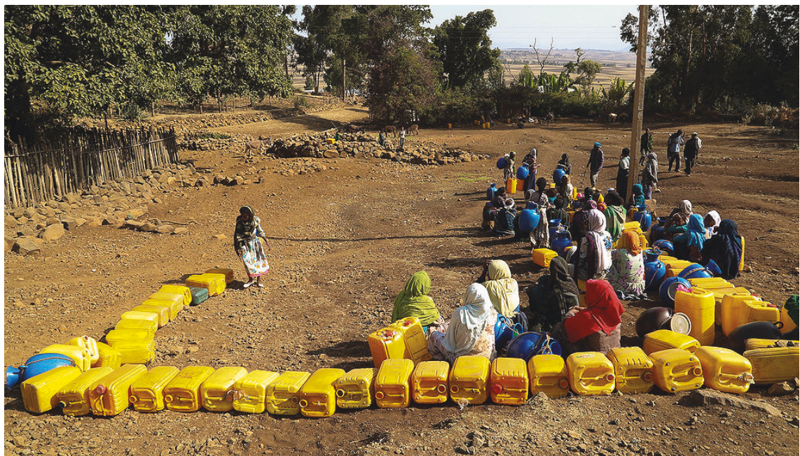
Photo: A borehole for people in Mankorkoria and Ansela Kebele, Ethiopia, serves 400 households who are allowed a couple of jerrycans every other day.

Water insecurity also complicates people's ability to participate in social distancing if they have to fetch their own water.