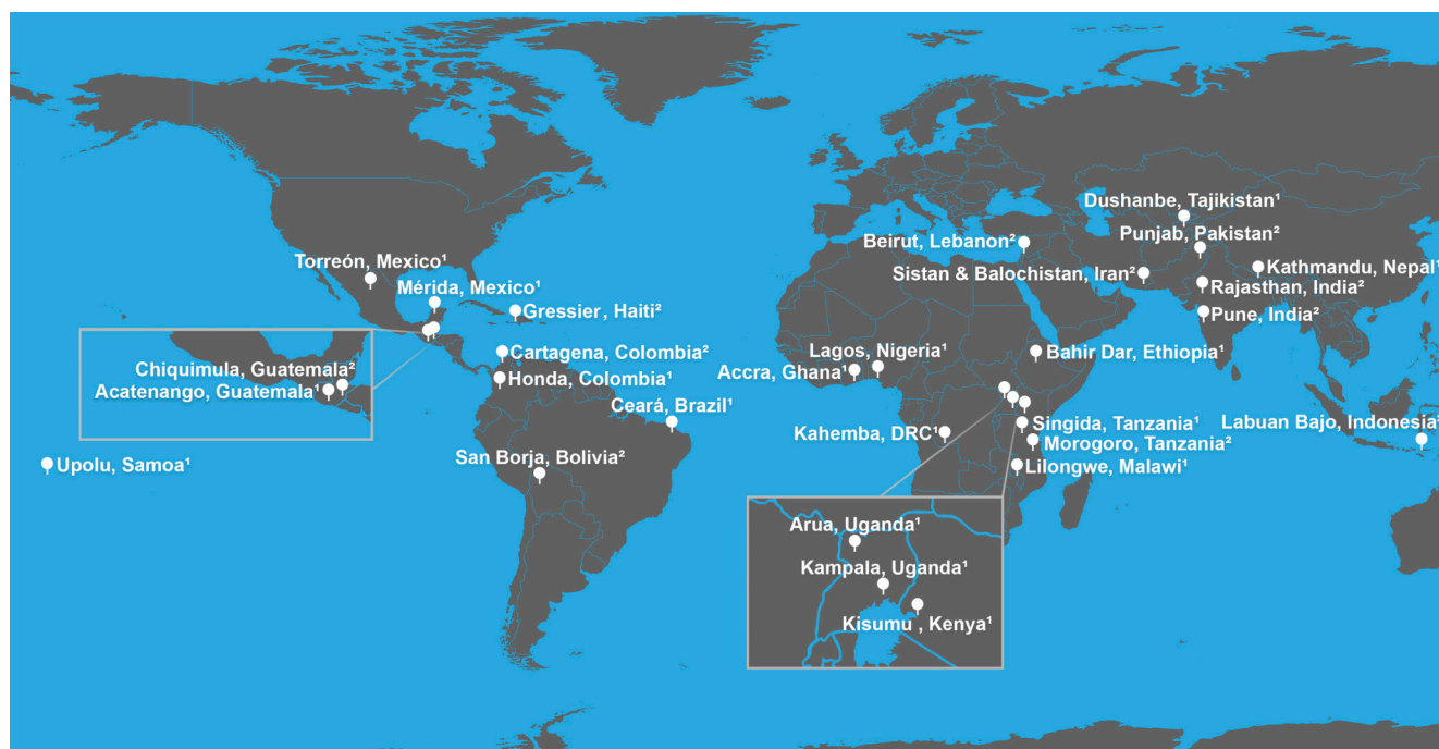
Figure 1 Map of 28 Household Water InSecurity Experience study sites across 23 low-income and middle-income countries. (1) Module version 1 implemented; (2) module version 2 implemented. Image credit: Frank Elavsky, Northwestern University Information Technology, Research Computing Services.

JMP survey items 11 ; experiences of water insecurity; household food insecurity using the Household Food Insecurity Access Scale 21 ; and perceived stress using the modified four-item Perceived Stress Scale. 22 In module version 2, we also included items on perceived water status in the community using a ladder scale (range 1–10) and satisfaction with water situation (1–5 Likert scale). Surveys were conducted in the participants' preferred language and lasted approximately 45 min. Cross-sectional data collection occurred from March 2017 to July 2018. 19 Data were uploaded to a centralised aggregate server (Google App Engine) and cleaned using a standard protocol. 19