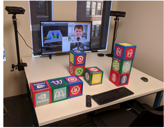
Figure 1: The blocks world apparatus setup.