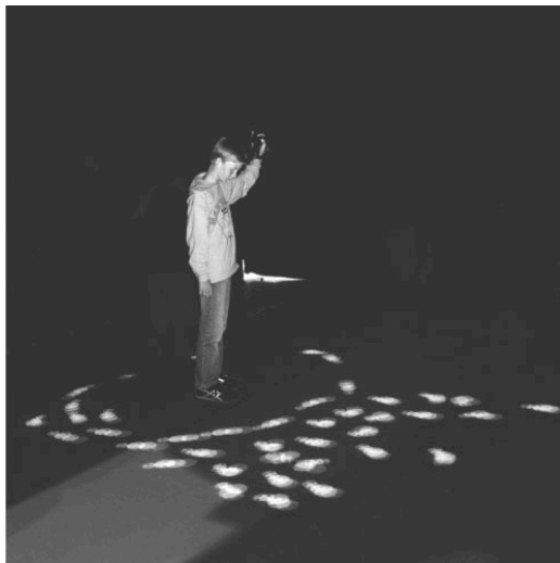
Figure 2: In The Swarm , children interact with a swarm of lights that respond to gesture and motion. They are able to dive in to immerse themselves in the experience and then step out to reflect on the algorithm that created the collective movement.

For almost two decades, Heidi and her many collaborators have designed and studied digital fabrication workshops for children under the name TechKreativ . TechKreativ encompasses the design of tools, materials, programming environments, and activities for learning. Among the many TechKreativ