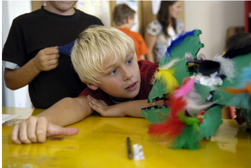
Figure 1: TechKreativ encompasses the design of digital fabrication tools, materials, and programming environments for learning.