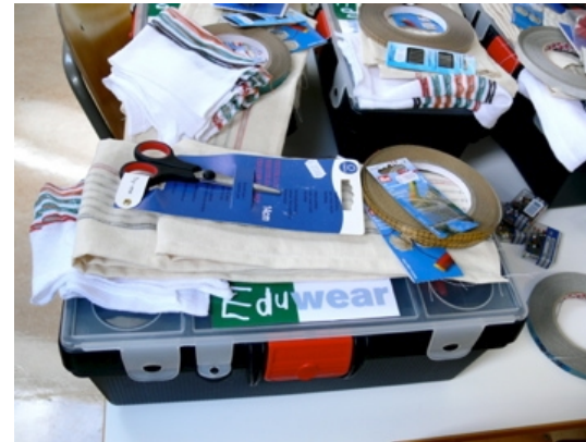
Figure 3: With the EduWear toolkit from TechKreativ, children engineer their own intelligent textiles.

projects, the eduwear toolkit was a close collaboration with Leah Buechley in which children used the LilyPad Arduino platform to create their own “intelligent” textiles [7]. Another project called “The Swarm” embodies Edith’s metaphor of diving in and stepping out. Children engage in lively interactions with a swarm of lights projected on the floor that respond to gesture and movement. Children dive into the swarm (immersing themselves in the experience) and then step back to reflect on the algorithm that created collective movement [5]. In more recent projects, teens are designing and prototyping their own BMX ramps that they reflect on in relation to life size equipment [9].